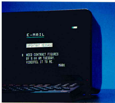
An important message on your Videotel electronic mailbox.

Imagine, communications at the speed of sight. Videotel Desktop Communications is changing the way business communicates.